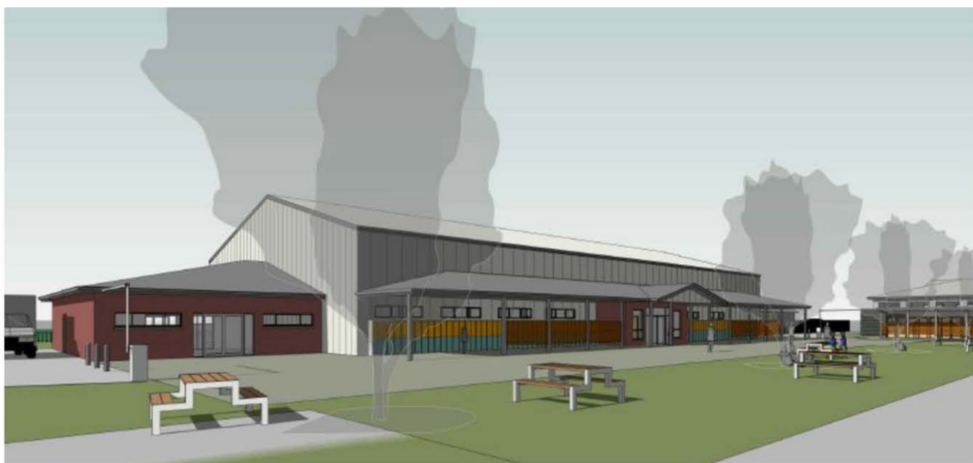
Figure 13 Proposed Multipurpose Hall from west

The full draft concept plan is available on our website .